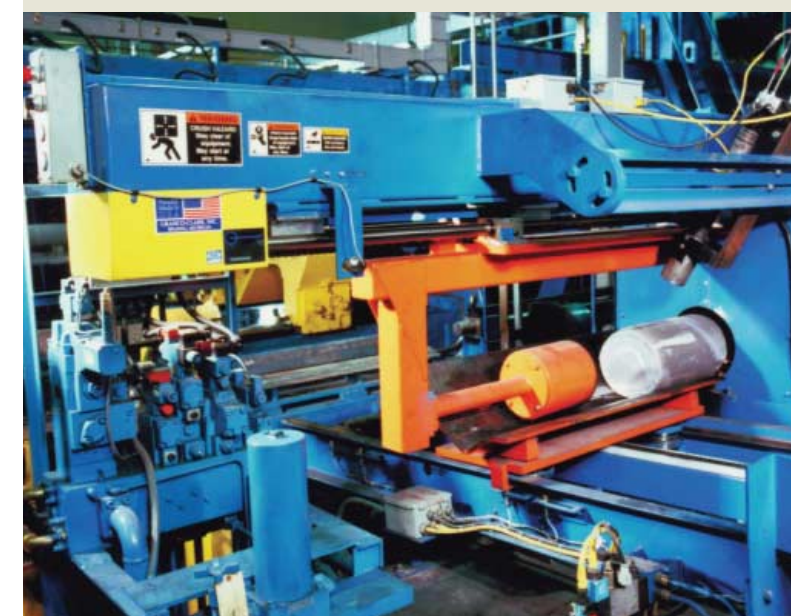
Granco Clark's unique, triple-patented Taper Quench is the most economical way to produce the temperature gradients required for isothermal extrusion. It also allows for quick solutionizing of billets.